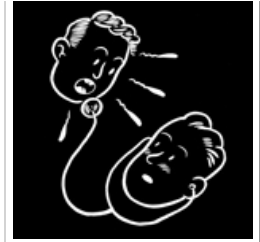
Invitation to a Dialogue: Arguing With Doctors

Home | World | U.S. | N.Y./Region | Business | Technology | Science | Health | Sports | Opinion | Arts | Style | Travel | Jobs | Real Estate | Autos | Site Map