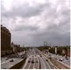
A Journey Home, in Search of Himself