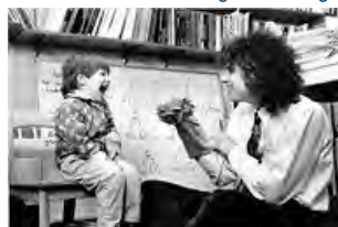
WORDPLAY Dr. Pinker, in 1991 at M.I.T., showed how a puppet figured in his study of language development in children (here, a colleague's daughter).