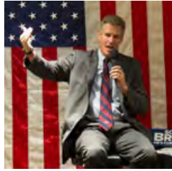
Former G.O.P. Hero Plays Down Label

to enmesh the United States in a minefield of regional rivalries.