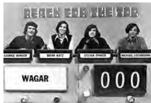
BEFORE THE PH.D. Steven Pinker in 1971 with fellow Wagar High School students on a Canadian television quiz show.