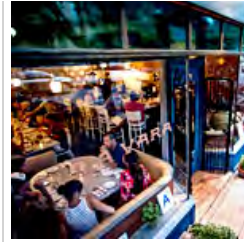
A Reunion of Flavors From Spain

to enmesh the United States in a minefield of regional rivalries.